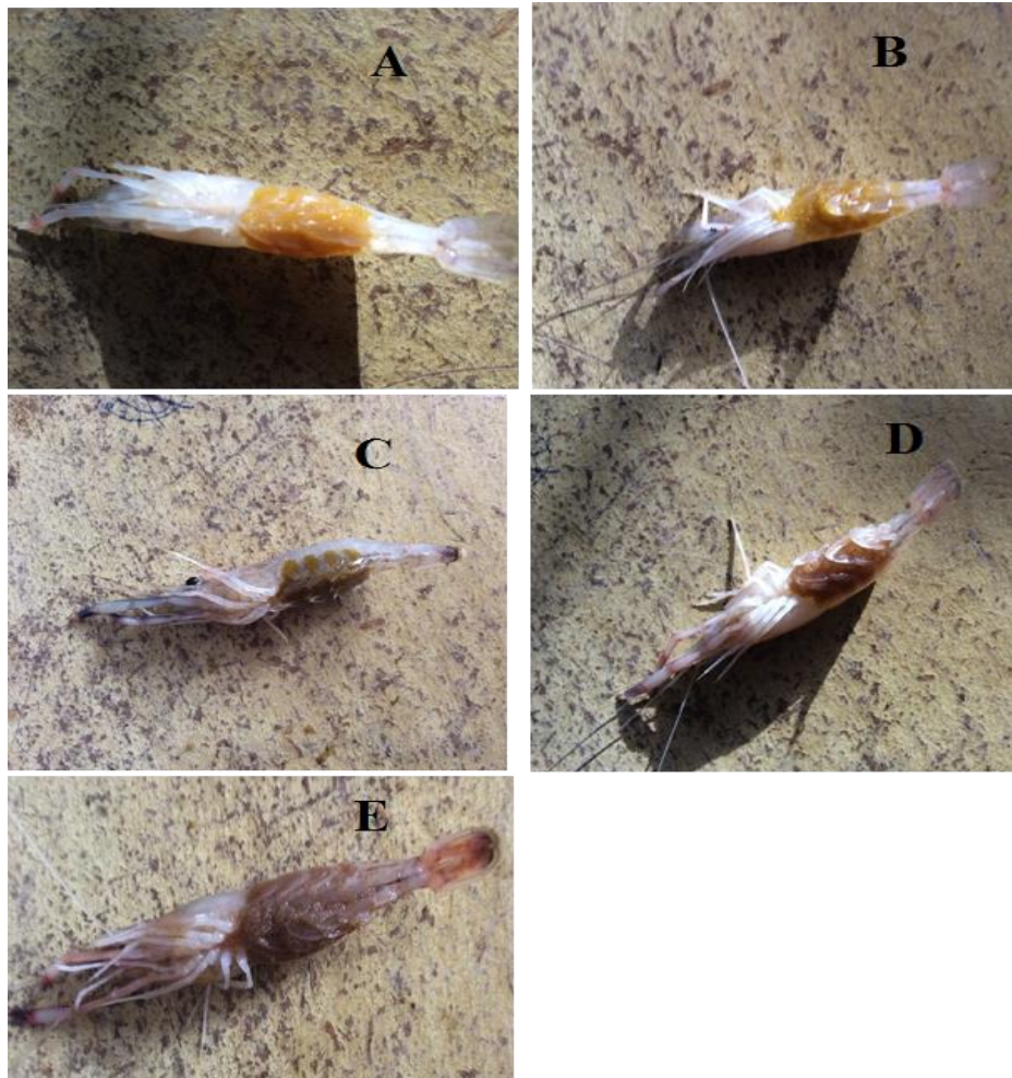
Figure 4: Stages of Embryonic Development, Based on Egg Colour of M. felicinum . A= Stage I (Orange coloured eggs), B= Stage II (Light green-coloured eggs), C= Stage III (Dark green-coloured eggs), D= Stage IV (Brown coloured eggs) and E=Stage V (Gray coloured eggs).

Parapenaeopsis stylifera . These observations contradict the reports of Menon (1957) and Marioghae (1982) where the sex ratio was the same. In this study area, it is likely that more females of M. felicinum are prone or vulnerable to catch in nature than the males which migrate into deeper waters soon after spawning. Tawari-Fufeyin et. al. (2005) reported that sex ratios may not always be static, as they vary from season to season or from year to year within the same population.