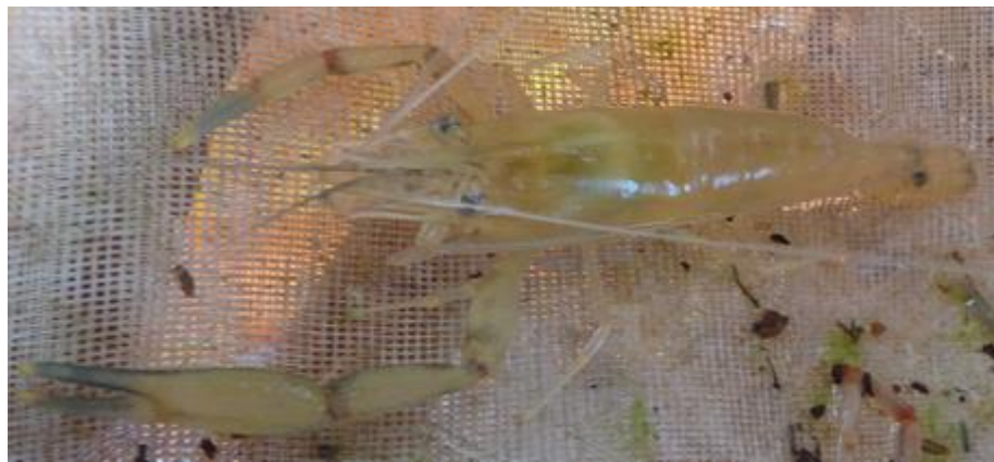
Figure 1: Macrobrachium felicinum .

River Benue (Obande and Kusemiju, 2006; Ayoola, et al. , 2009; Bello-Olusoji et al. , 1997) have studied its distribution in Nigeria. A lot of work has been done on the sex population structure and other aspects of Macrobrachium species (Marioghae, 1982; Powell, 1980; Nwosu and Wolfi, 2006; Ukagwu et al. , 2020). This study is in continuation with some other studies and it is reporting on the sex ratio, fecundity and egg development of M. felicinum . The knowledge of reproductive biology of this species is important for evaluation of their potentials for commercial farming, as well as an estimation of the stock size of natural population.