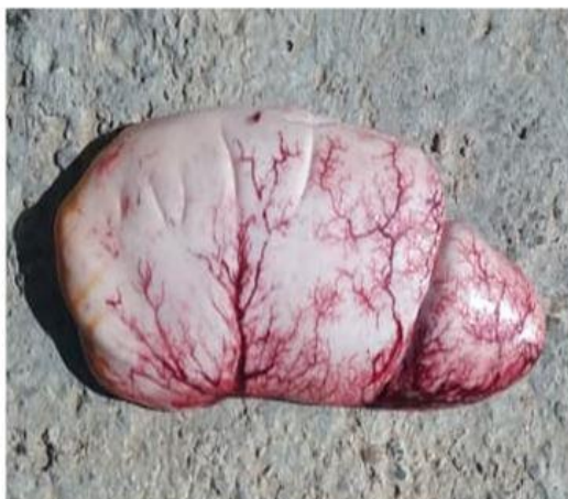
Figure 2: All male gonads (testicles) from sex reversed male by oral administration of MT hormone.

highest sex reversal ratio was observed in group treated with 3 mg/kg 17\alpha -methyl testosterone (Fig. 2).