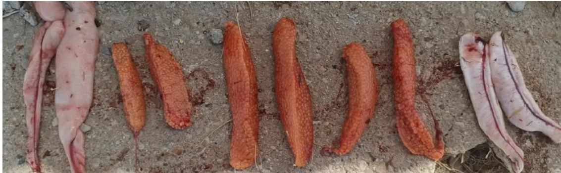
Figure 1: Natural testis and ovaries of fish in control group.

and ovaries (Fig. 1). Examination of the results showed that 17\alpha -methyltestosterone was effective in sex reversed of rainbow trout.