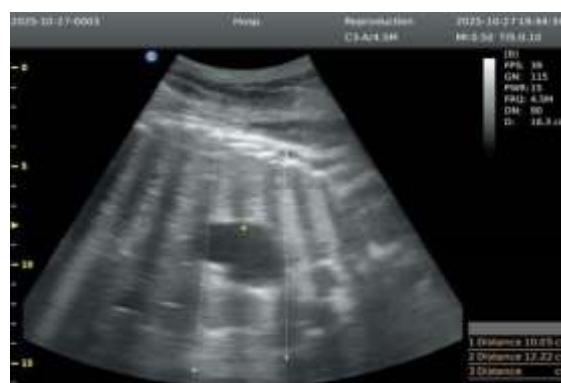
Figure 9: Ultrasonographic Image of 180 days pregnancy Showing TD & BD Measurement