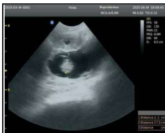
Figure 1: Ultrasonographic image Day 30 pregnancy (normal)

Linear regression (GA on HD): GA_{HD} \approx -116.4 + 5.88 \times HD