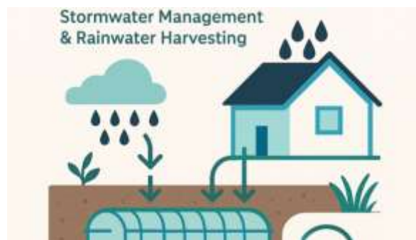
Fig.2: Rainwater Harvesting and Stormwater Management